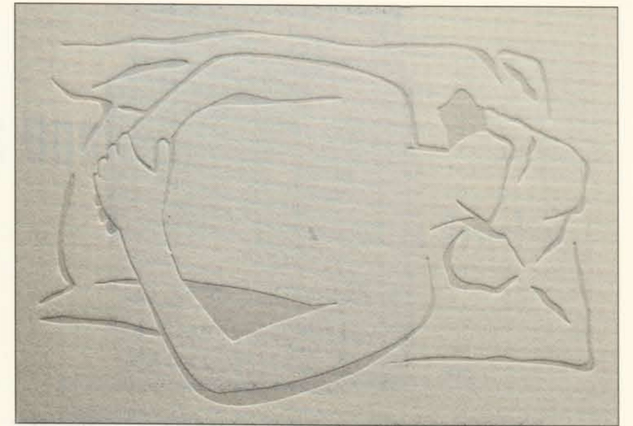
Access & Closure , Toby Millman, 2008

Access & Closure is short, too short, a common problem with many artist's books. Millman's successful strategy of using fragments as persuasion succeeds in engaging the reader just as the book ends. This is a 64-page book with text blocks on nearly every other